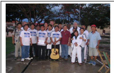
Akil seminary students and our mission group, June 2009.